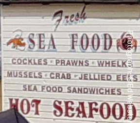
Photo of Weston-super-Mare beach